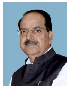
Prof. B.N. Tripathi Vice Chancellor SKUAST-Jammu

Rabi crops form the backbone of agricultural activity in the Jammu region during the winter season. Crops such as wheat, mustard, chickpea, lentil, oats, and barley play a crucial role in ensuring food and nutritional security, fodder availability, and enhancing the livelihoods of farming communities. However, to unlock their full productivity potential, there is a need to promote scientifically proven, location-specific practices that can help farmers improve yields, resource use efficiency, and resilience to climate variability.